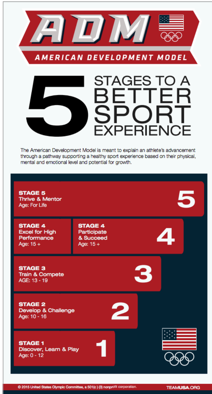
FIGURE 4.2 American Development Model.

The USOC, in partnership with the NGBs, created the American Development Model (ADM) 5 to help Americans realize their full athletic potential and utilize sport as a path toward an active and healthy lifestyle. The ADM was inspired and informed by the principles that underpin the long-term athlete development (LTAD) model, 6 which proposed seven stages of athlete development intended to achieve three outcomes (physical literacy, improved performance and lifelong participation). The ADM is an evolution of the LTAD model that fits the Team USA coaching context while promoting sustained physical activity, participation in sport and Olympic and Paralympic success (see figure 4.2).